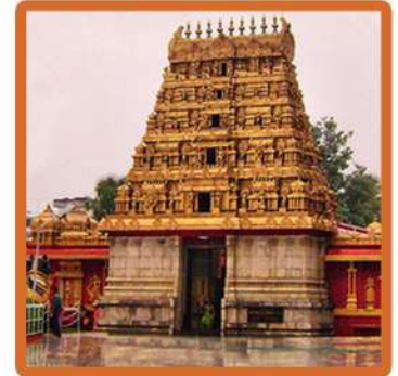
Kudroli Gokarnanath Temple