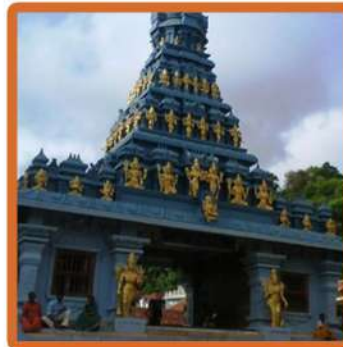
Kadri Shree Manjunatha Temple