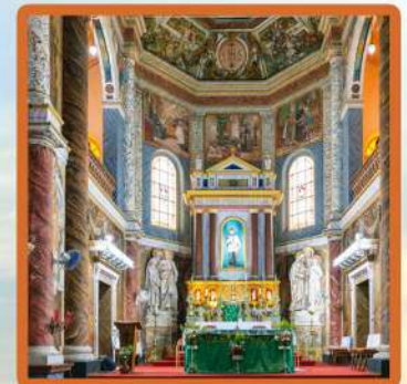
St. Aloysius Chapel